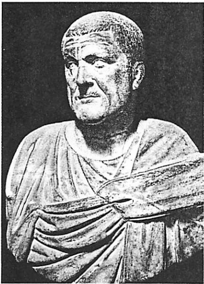
ALUMINUM RESOURCE, NEW YORK

The "best of the Cimbri were immediately cut to pieces," related Plutarch, "for they had linked themselves together with long iron chains passed through their belts in an attempt to preserve an unbroken front." Romans claim that more than 120,000 Cimbri died that day