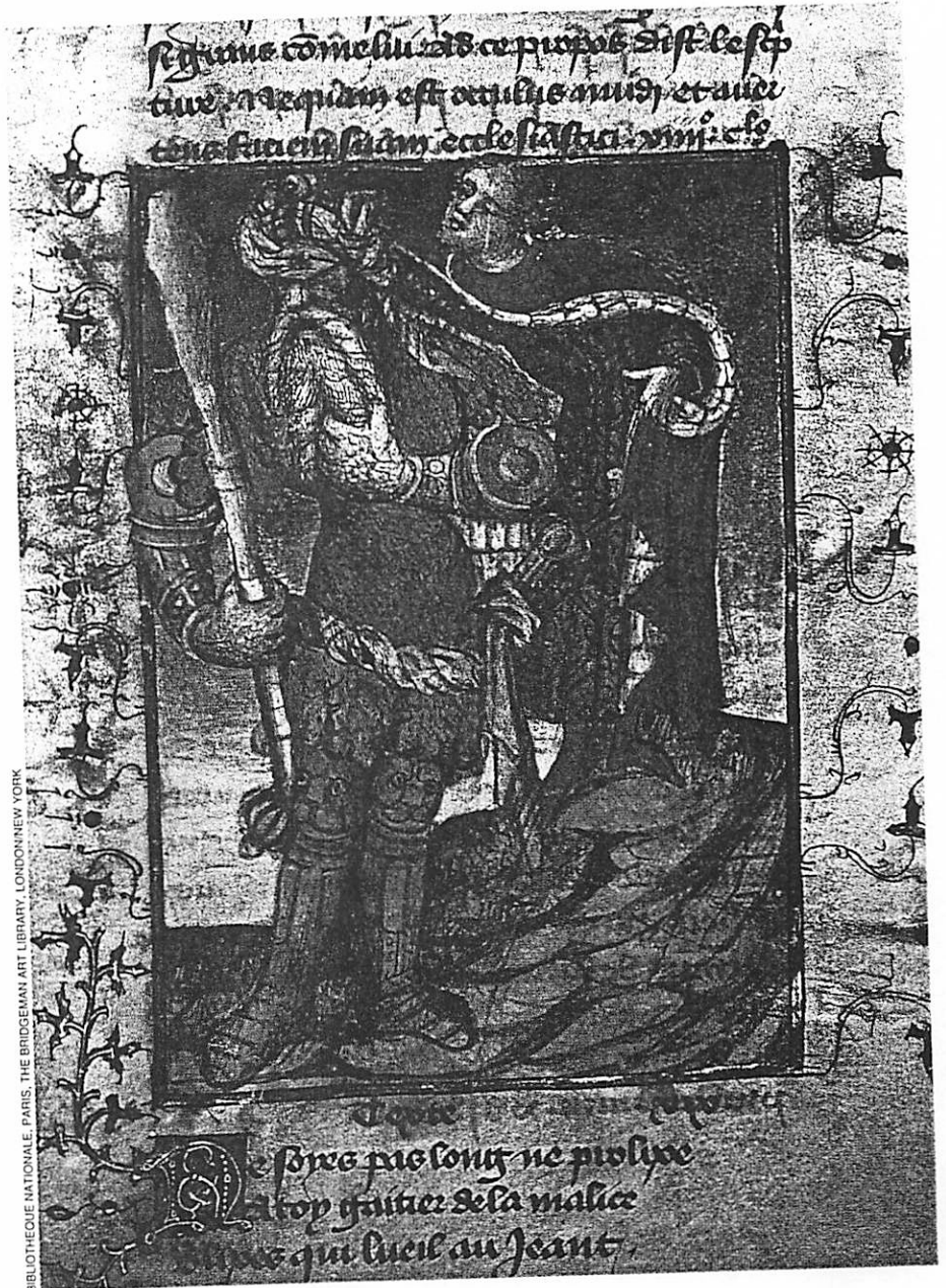
The wily Greek hero Odysseus blinded the giant Cyclops Polyphemus, as depicted in The Epistle of Othea, written by Christine de Pisan.

In the Dead Sea Scrolls, Goliath was described as a warrior of six feet four inches, still an imposing opponent in the eyes of an average ancient man of five feet five inches. According to Israeli antiquities authority Joe Zias, biblical copyists added a cubit here and a span there, until Goliath towered ten feet tall. In Jericho, notes Zias, archaeologists discovered a casket containing the skeleton of a six-foot man buried in the first century B.C. or A.D. The casket was inscribed with the nickname "Goliath," demonstrating that